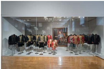
Exhibition View