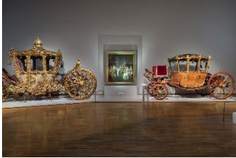
Exhibition View