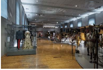
Exhibition View